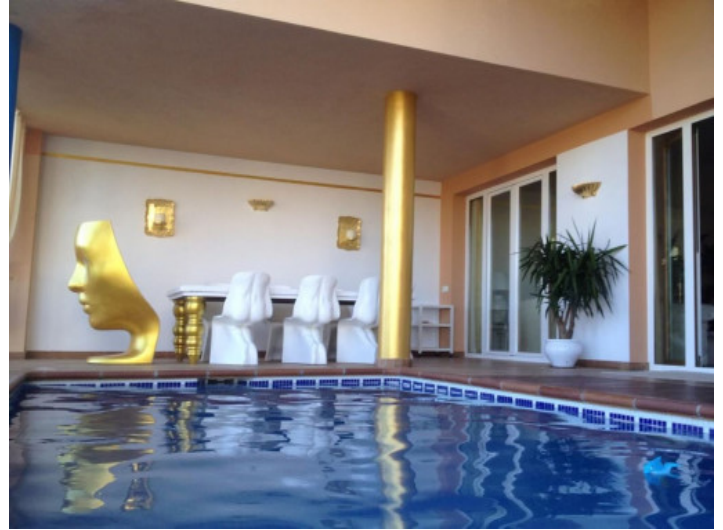
Private heated pool