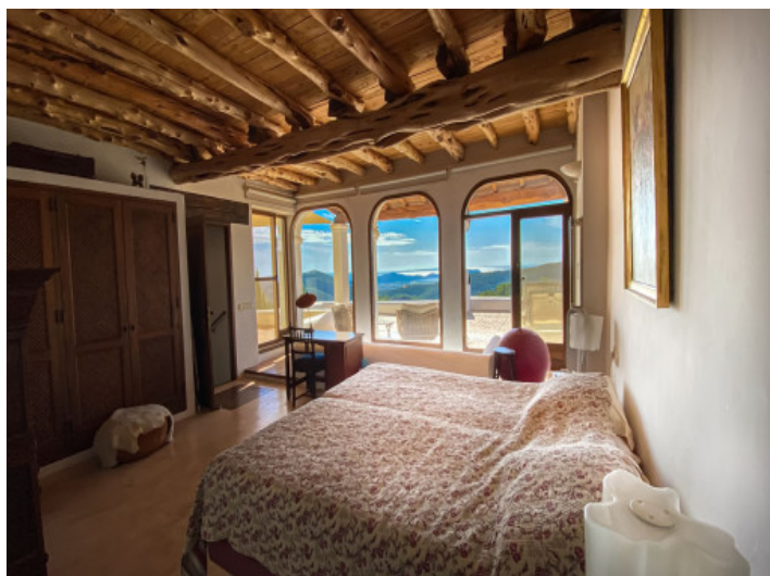
Wake up with stunning views