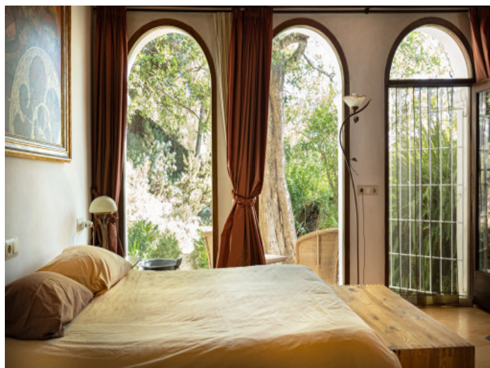
Twinkle twinkle little star

All information is correct to the best of our knowledge. Errors and prior sale excepted. This prospectus is purely for information purposes. Only the notarized deed of sale is legally binding.