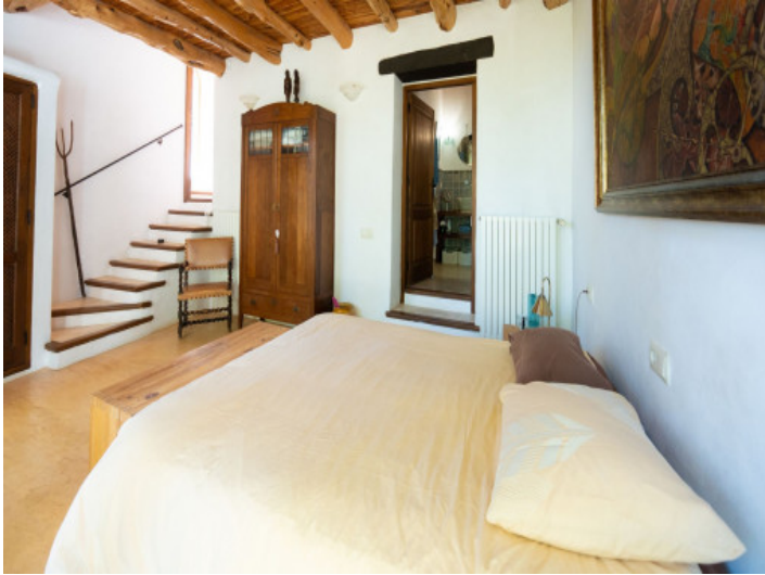
A total of 3 bedrooms