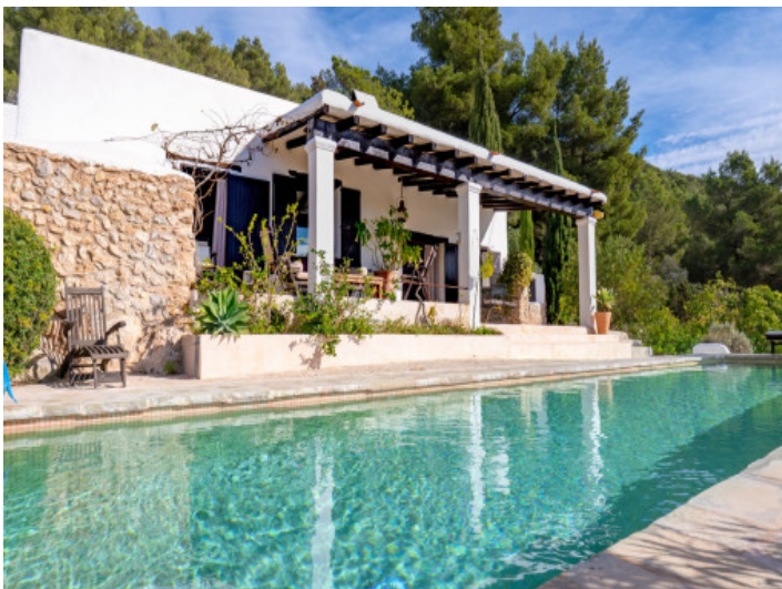
A lot of joy