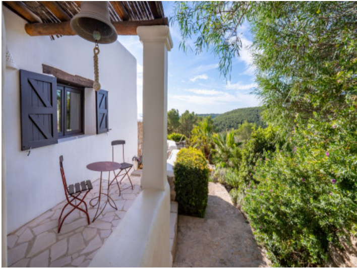
A relaxing place to be comfortable