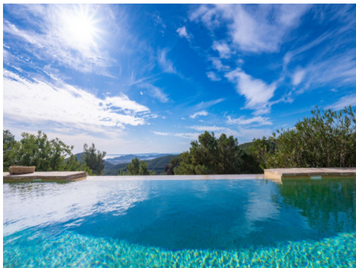
A very special place