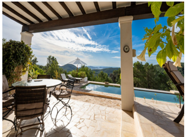
A little gem

All information is correct to the best of our knowledge. Errors and prior sale excepted. This prospectus is purely for information purposes. Only the notarized deed of sale is legally binding.