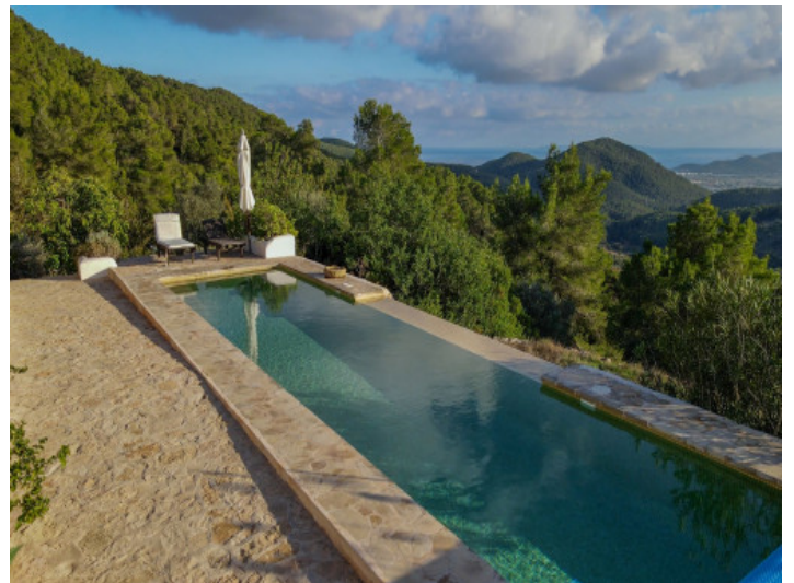
Infinity pool with amazing views