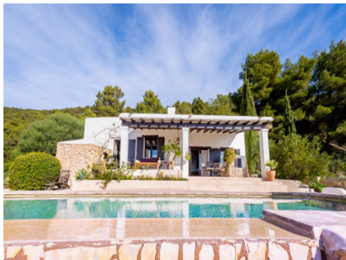
To fall in love