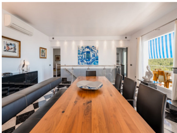
Elegant dining area

All information is correct to the best of our knowledge. Errors and prior sale excepted. This prospectus is purely for information purposes. Only the notarized deed of sale is legally binding.