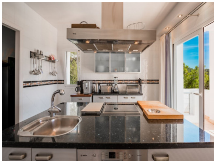
Large cooking island