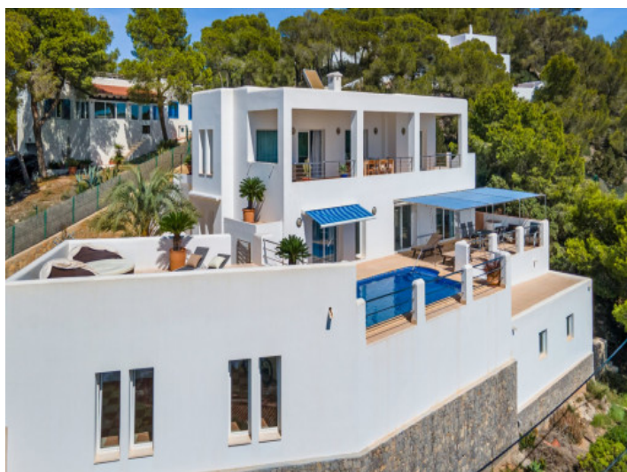
View to the villa