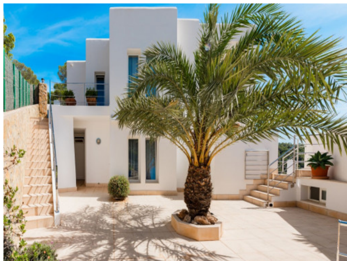
Stylish villa with sea views close to Sant Josep