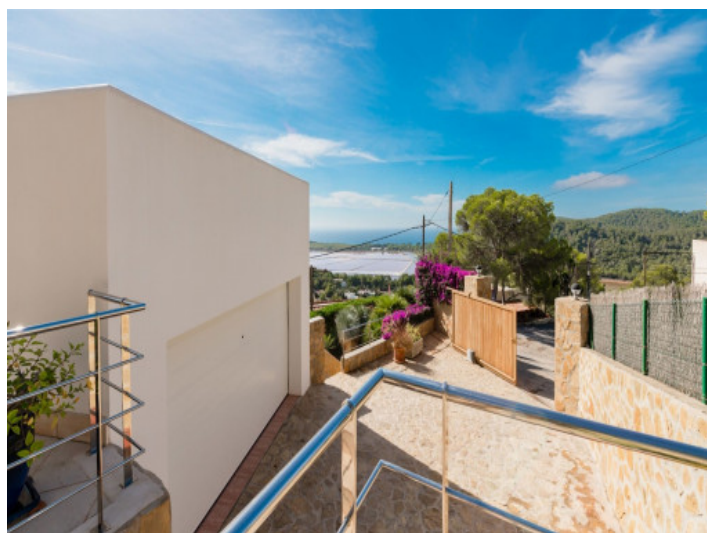
Entrance area and parking space