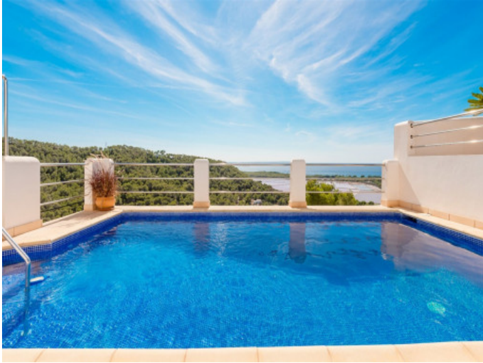
Pool with sea views