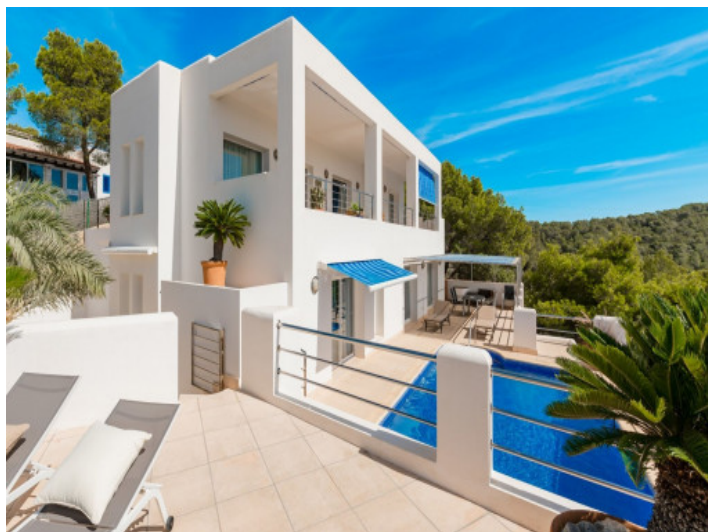
Back façade and pool