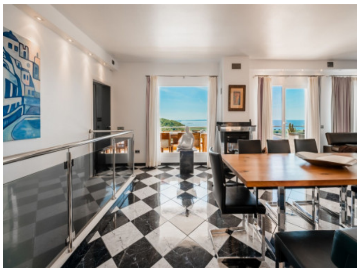
Light-flooded dining area