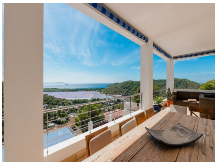
Covered terrace with a view of the salt marshes and the sea