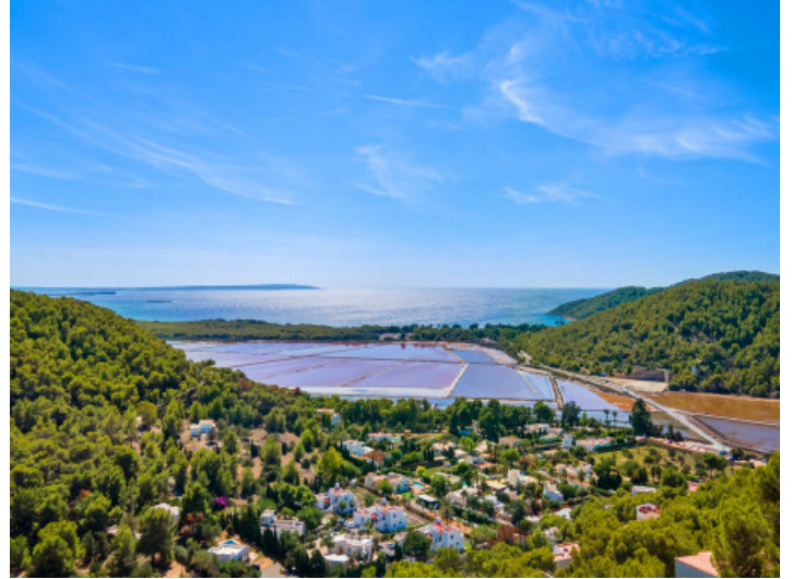
Marvelous sea viws

All information is correct to the best of our knowledge. Errors and prior sale excepted. This prospectus is purely for information purposes. Only the notarized deed of sale is legally binding.