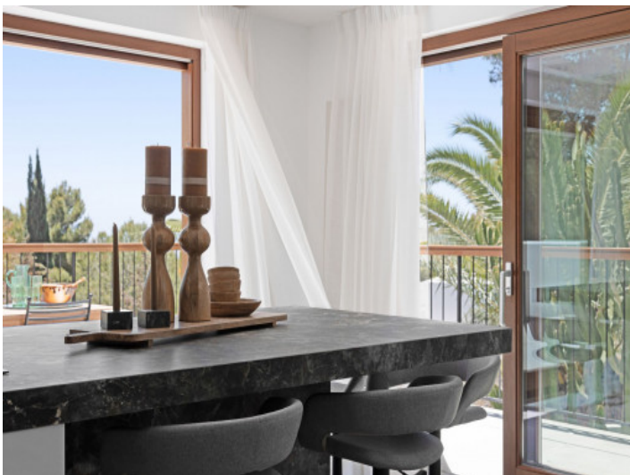
Flooded with light