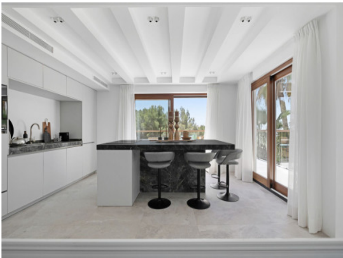
Large cooking island