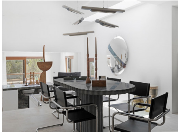
Stylish dining area