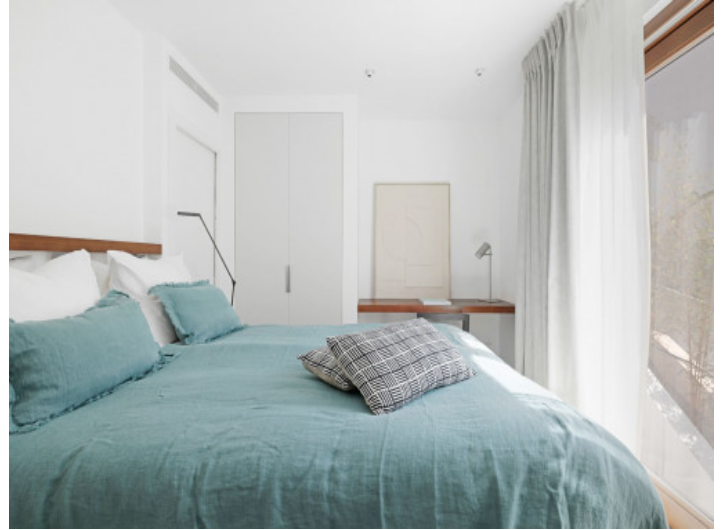
All bedrooms Built-in wardrobes