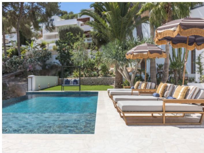
Relaxing pool area