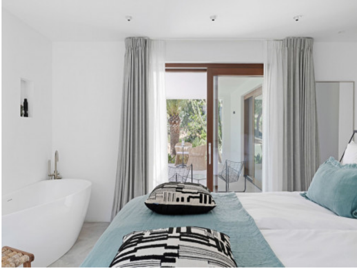
All bedrooms with bathroom en suite