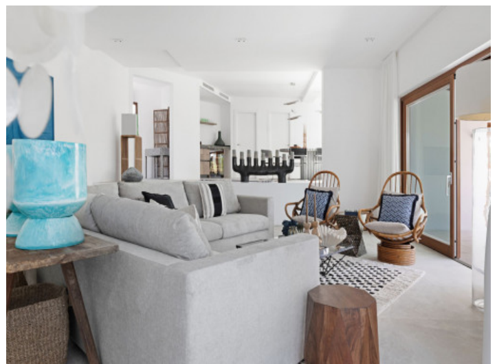
View from the living room to the dining room

All information is correct to the best of our knowledge. Errors and prior sale excepted. This prospectus is purely for information purposes. Only the notarized deed of sale is legally binding.