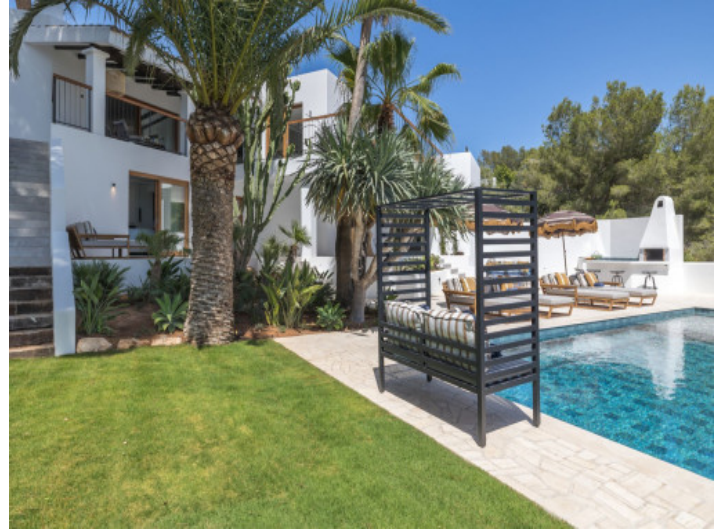
Very well maintained property