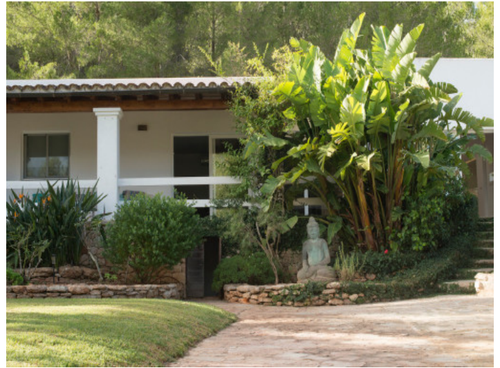
View to the villa