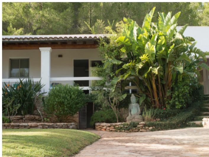
View to the villa