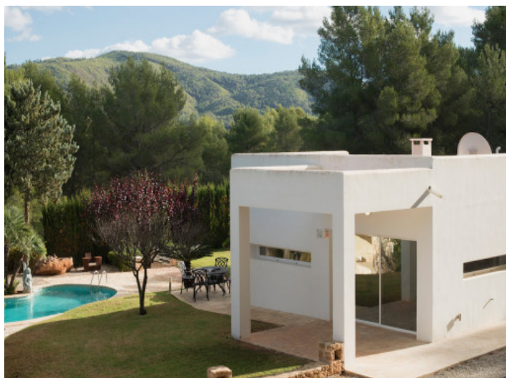
View to the villa