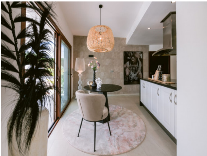
Dining area close to the kitchen