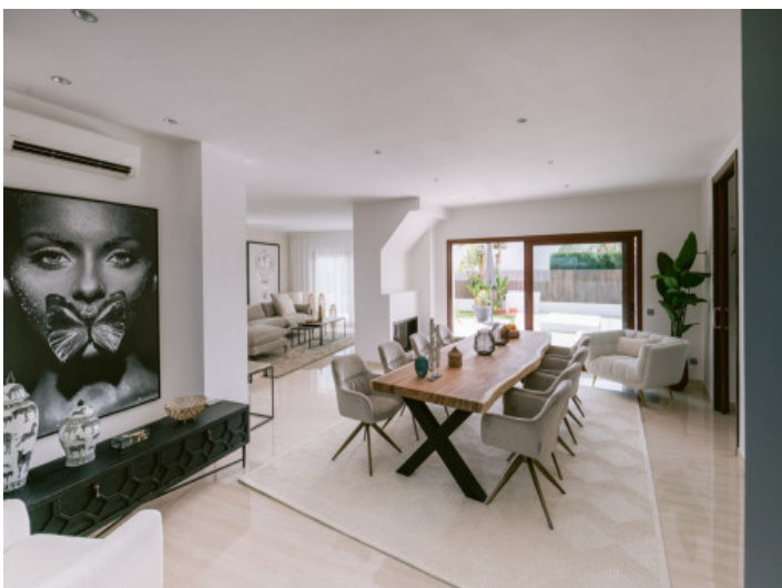
Living and dining room