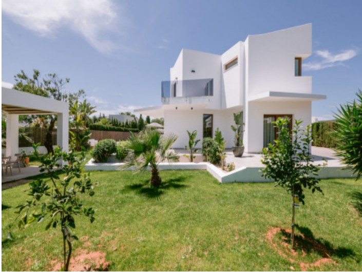
View to the villa