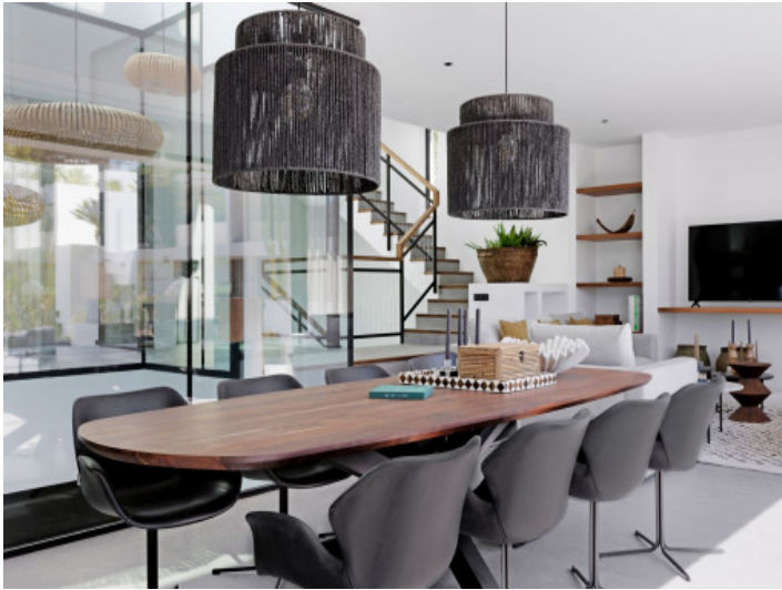
Elegant dining area