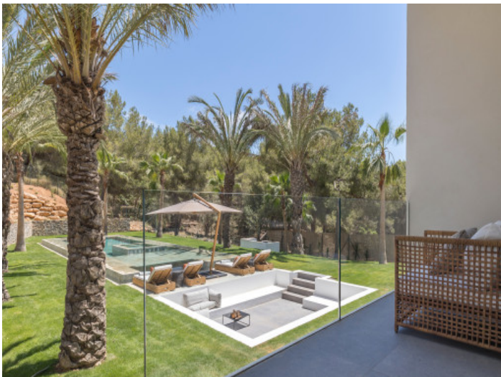
Very nice garden