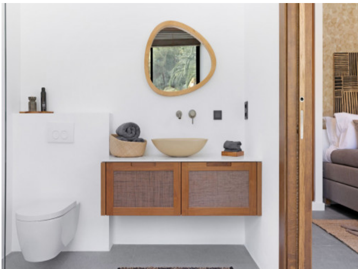
En suite bathroom