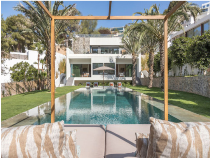
Elegant pool area