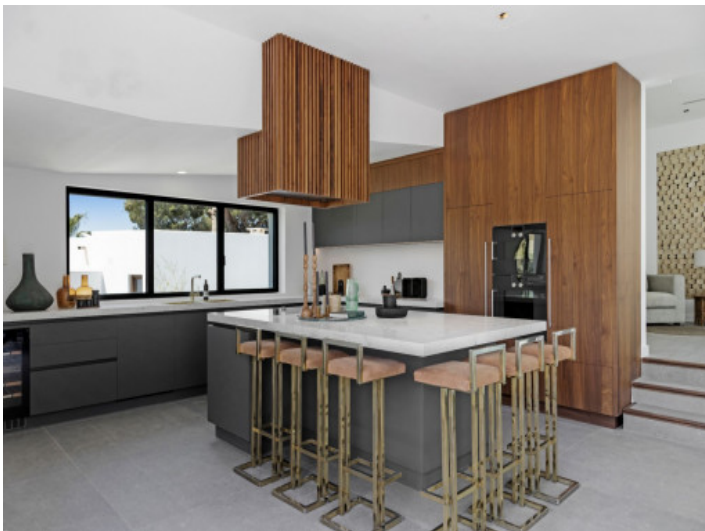
Modern kitchen with large kitchen island