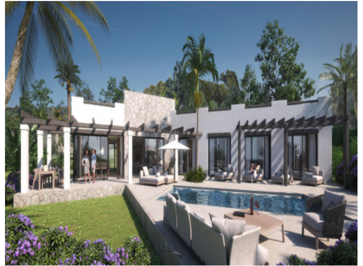
View to the property