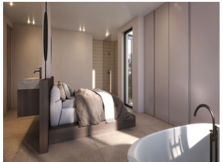
One of several bathrooms

All information is correct to the best of our knowledge. Errors and prior sale excepted. This prospectus is purely for information purposes. Only the notarized deed of sale is legally binding.